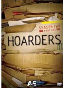
Clips from the case of Chris shown on Season Two of A&E Hoarders (2009)